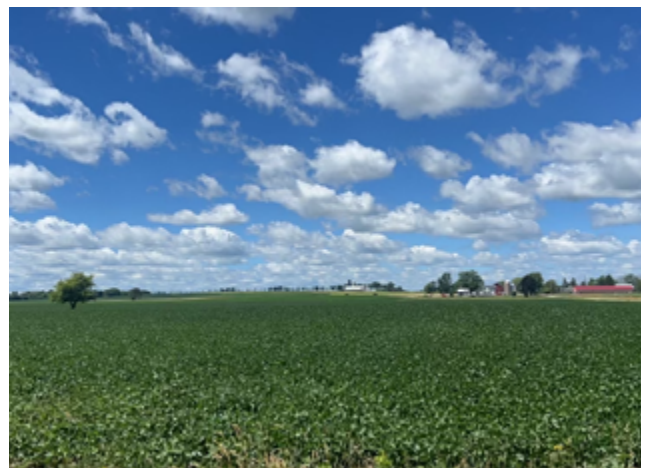
Typical Wisconsin landscape in the summer.