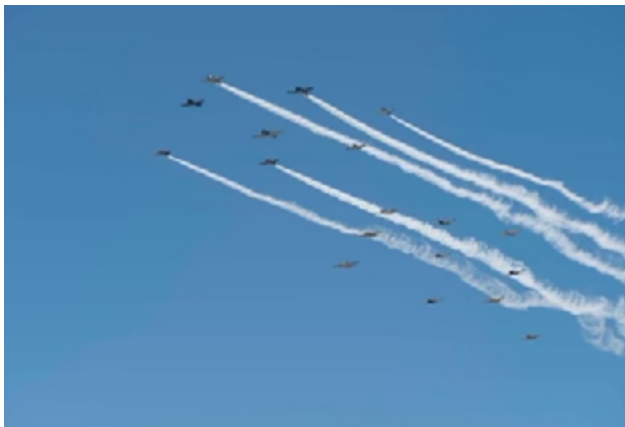
The Memorial Squadron in action on the 4th of July, 2022