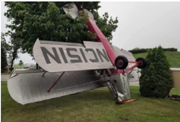
On July 23rd, 2022 at AirVenture, a storm passed through the area bringing surface winds of 70 mph. Tents were blown away, airplanes were damaged and in this case a plane was flipped upside down.