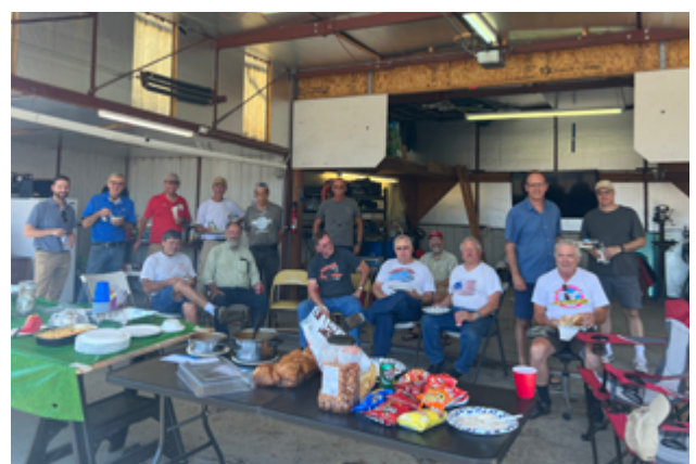
B-9 Hangar lunch on the northwest side of the airport. These have been a semi regular event with an average attendance of over 20 pilots and builders. This provides a great opportunity to build the local aviation community.