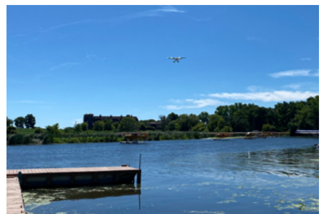
Cessna 182 floatplane coming in for a landing at the AirVenture Seaplane base.