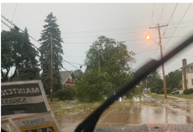
In town, trees and power lines were blown down. Interestingly enough, power was quickly restored and debris was cleaned up promptly! From my experience, this is a part of the AirVenture experience. Part of the "Baptism" if you will.