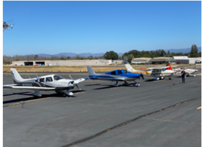
WEDNESDAY FLY OUT AUGUST 24TH, 2022 AT LAMPSON CA

Let's see what are friends are up to in the last month!