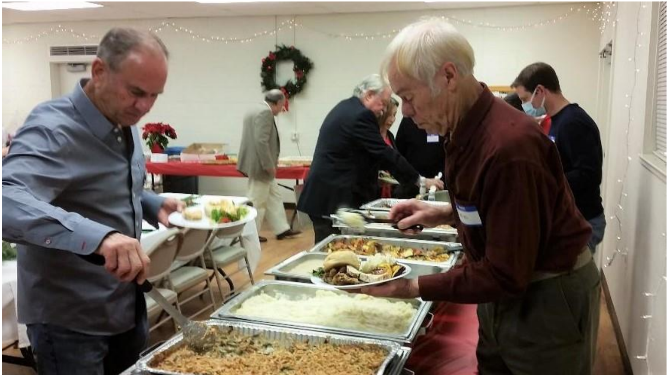
A most superior and delicious meal.