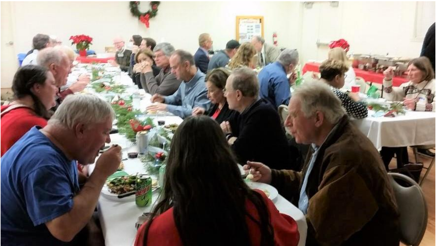
Enjoying the feast.