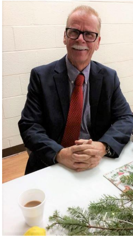
El Presidente de EAA 393.