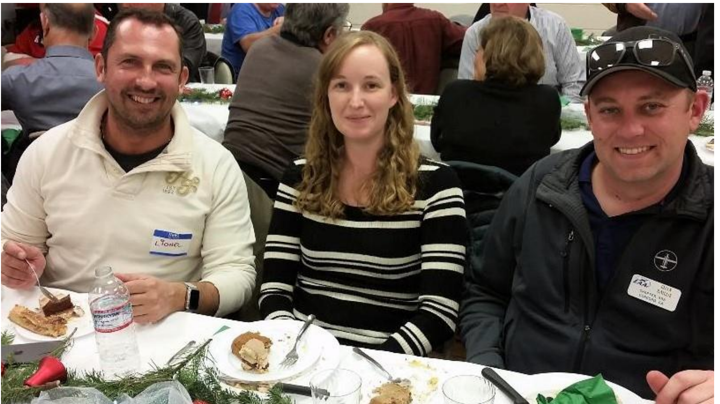
Three happy diners.