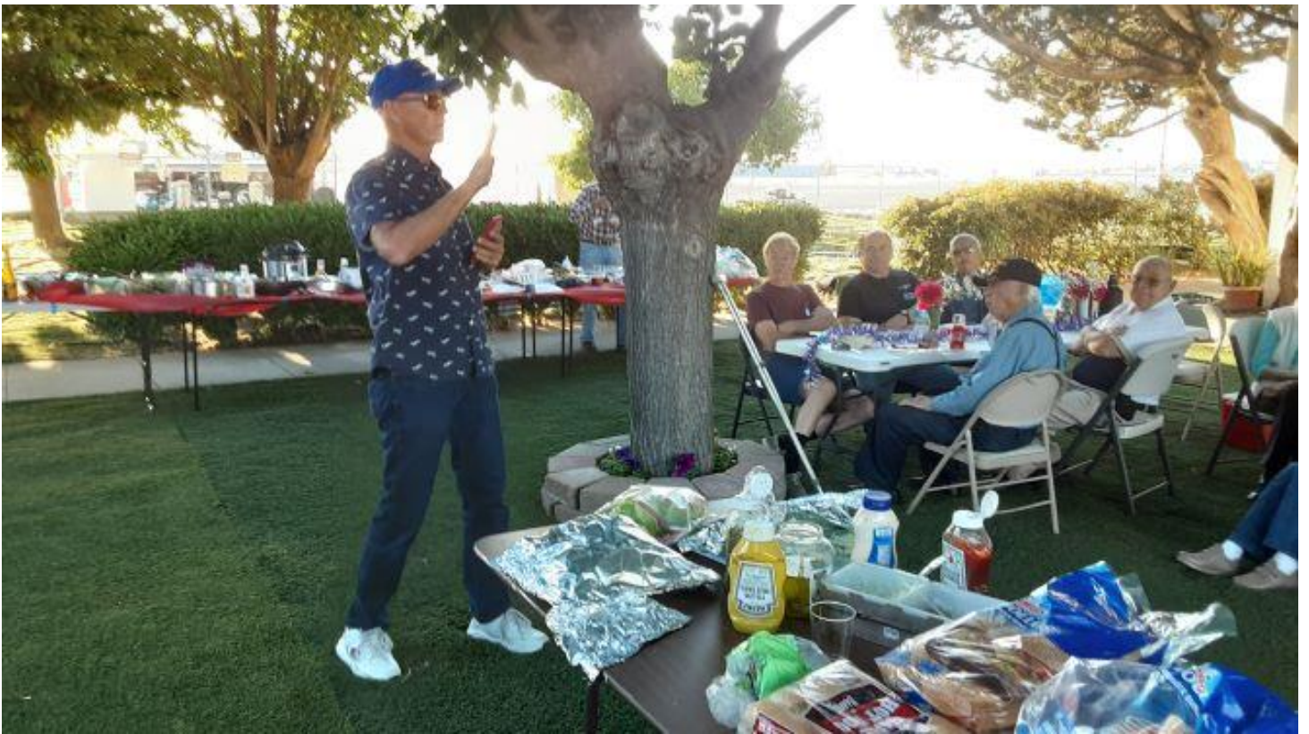
El President presides.