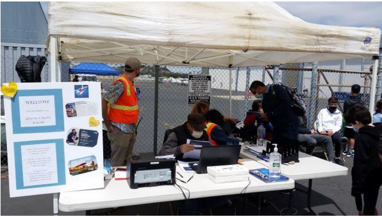
Happy flyers, young and older.