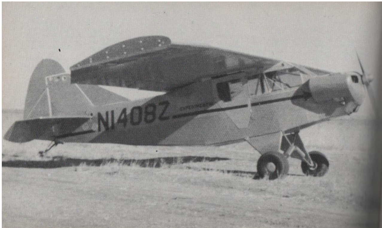
And next, the text, details, history, etc