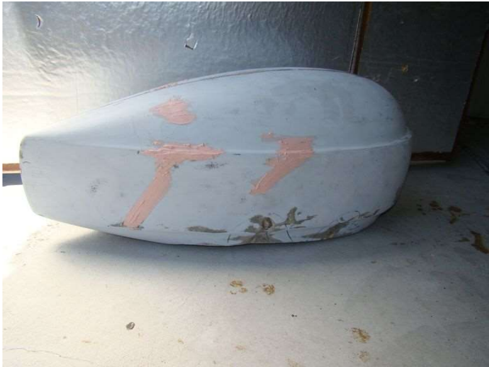
Ye Olde briefcase