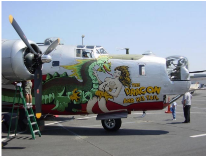
• Collings B-24 "The Dragon and His Tail"