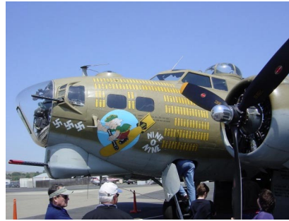
Collings B-17 "Nine O Nine"

The Mount Diablo Pilots Association is sponsoring an Air Safety Foundation Seminar on "GPS for VFR Operations" for Friday, May 30, 2003 at 7:00 pm at their building, 200 Sally Ride Drive, Concord, CA. See http://www.mdpa.org/ . This qualifies for the FAA "Wings" program. A $5 donation for refreshments is requested for non-MDPA members.