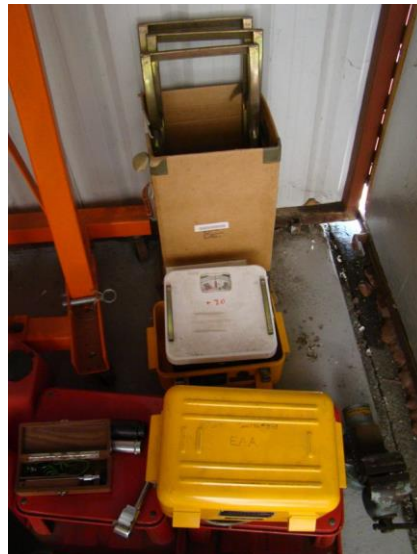
Bathroom Scales & Multiplier Arms