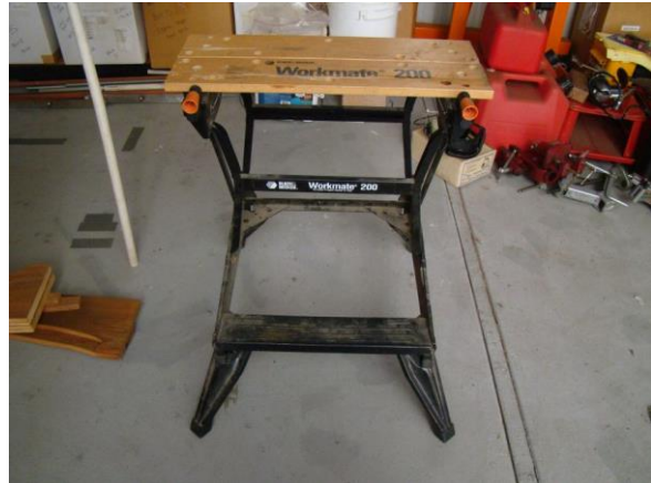
B&D Workmate 2000